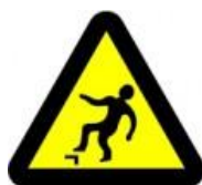
Caution, uneven surface