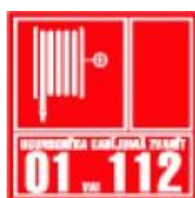
Complex indication for fire hose