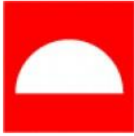
Fire-fighting equipment and materials