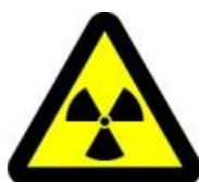
Radioactive or ionizing substance