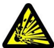
Explosive atmosphere or risk of explosion