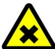
Harmful or irritant substance